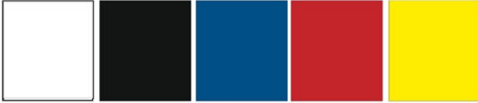
*3X2-201 Matte/White *3X2-401 Matte/Black *3X2-511 Matte/Blue *3X2-601 Matte/Red *3X2-701 Matte/Yellow

Check to see what colors are in stock. Most colors can be ordered within two days. This material offers you exterior grade plastic with a smooth face. Food handling areas, solvent shops, and dash boards are most common. You can choose what color to paint fill the letters from the back.