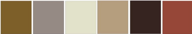
3X2-731 Matte/Vintage Gold 3X2-801 Matte/Taupe 3X2-811 Matte/Parchment 3X2-831 Matte/Beige 3X2-841 Matte/Dark Brown 3X2-861 Matte/Canyon