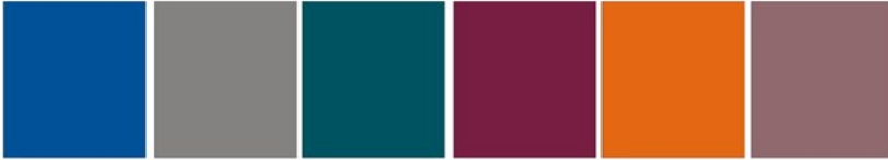
3X2-561 Matte/Sapphire 3X2-581 Matte/Driftwood 3X2-591 Matte/Ocean Blue 3X2-631 Matte/Ruby 3X2-651 Matte/Orange 3X2-661 Matte/Dusty Rose