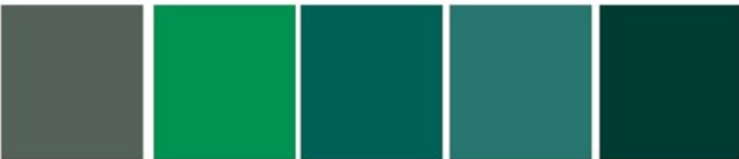
3X2-901 Matte/Black Forest Green 3X2-911 Matte/Bright Green 3X2-921 Matte/Teal 3X2-931 Matte/Celadon Green 3X2-991 Matte/Hunter Green